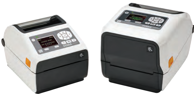
ZD620d-HC with LCD

As a healthcare provider, you need to give your healthcare professionals the tools to provide the very best in patient care, every second of every day. Zebra's ZD620-HC rises above conventional desktop printers with premium print quality and state of the art features. Available in both direct thermal and thermal transfer models, the ZD620-HC offers the most standard features of any Zebra desktop printer, as well as an optional color LCD and 10-button interface that simplify printer setup and status. Designed for healthcare, the ZD620-HC is ready for constant disinfecting and offers a healthcare-compliant power supply. With its optional 300 dpi printing, the tiniest labels are crisp and legible. The ZD620 runs Link-OS® and is supported by our powerful Print DNA suite of applications, utilities and developer tools that deliver a superior printing experience through better performance, simplified remote manageability and easier integration. The Zebra ZD620 — delivering the print speed, print quality and printer manageability you need to keep boost productivity, accuracy and the quality of care.