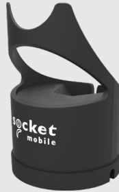
Charging Dock SKU# AC4133-1871