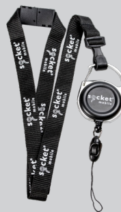
Lanyard - Black AC4100-1692