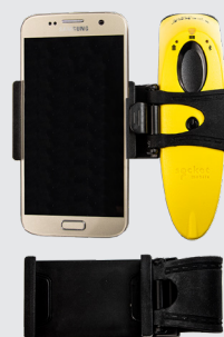
Scanner & Phone Holder