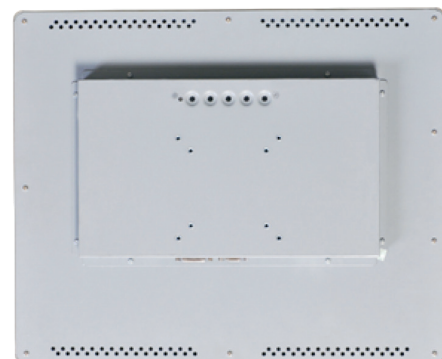
M19024-OF / M19024C-OF