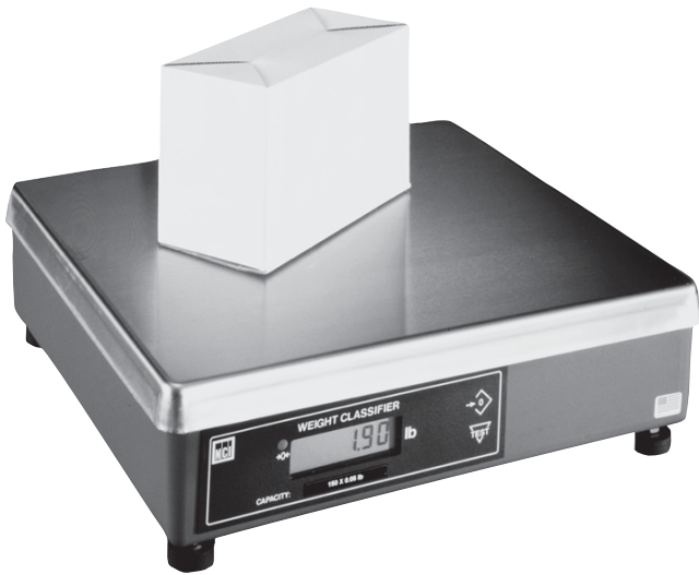
NCI Model 7820 shown with standard flat shroud.

The 7820 is simple to use, durable, accurate and reliable. This NTEP approved scale fits into any operation as a stand-alone scale, interfaced to a shipping manifest software, or receiving station.