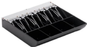
4 coin/4 bill money tray insert