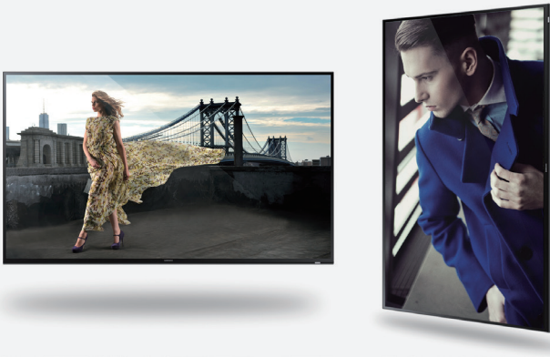
Figure 4. Pivot mode to fit the aesthetic setting while delivering dynamic content.

To meet the demands of traditional commercial environments, digital signage is often installed in portrait mode. Thus, it is critical that the digital signage supports portrait installation to fit to the aesthetics of the setting while still delivering the dynamic qualities of digital signage. QMD Series offers pivot mode that allows them to be installed in either landscape or portrait orientation to suit the environment's needs.