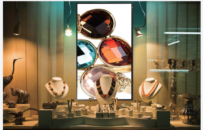
Figure 1. Commercial applications can leverage QMD Series clarity and operational capabilities.

Samsung QMD Series SMART Signage features a new design and delivers 3,840 x 2,160 resolution, multi-format PIP support, DP 1.2 support, set-back box (SBB) support, portrait or landscape orientation and reliable 16/7 operation for amazing flexibility and picture clarity in commercial settings. For example, retail stores can leverage Samsung QMD Series with UHD to improve their brand image and showcase products in sharp detail, while corporations and arena or museum security centers can use the high-resolution displays to enhance security with stable and vivid content playback.