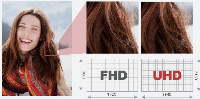
Figure 2. UHD high pixel density provides accurate detail representation.

QMD Series delivers four times the FHD resolution on the same screen area, resulting in the most accurate recreation of details possible. Text that displays on QMD Series in UHD is super-crisp due to its high pixel density. High-detail visuals, such as photos and videos, are visible with the smallest details for a hyper-realistic and immersive visual experience.