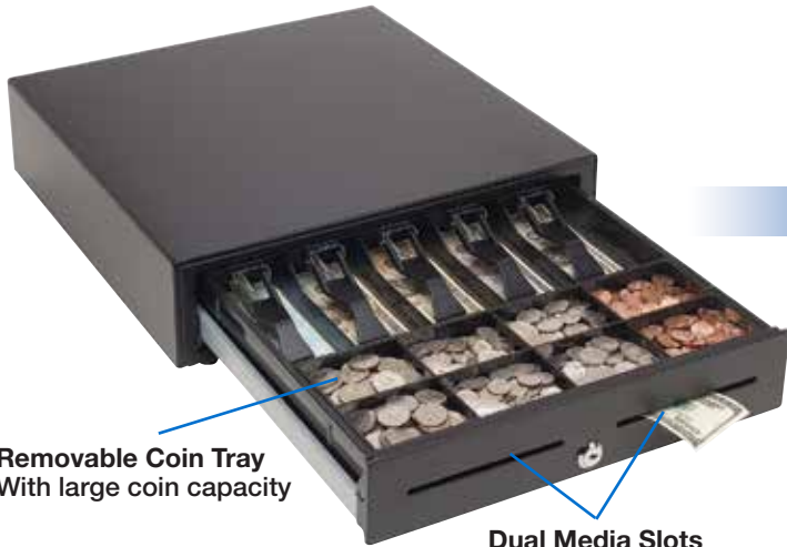
Removable Coin Tray With large coin capacity

Practical Size with Secured Till Design for Active Cash Environments