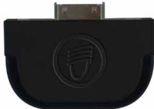
iDynamo Adapter kit available. Made for iPad 3, iPad 2, iPad, iPhone 4S, iPhone 4, iPhone 3GS, and iPod touch 2nd, 3rd and 4th generation.