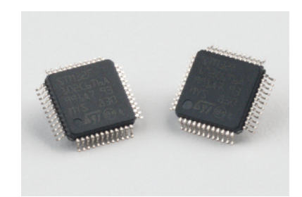
COACh V combo controller chip