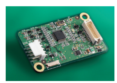
2218 combo controller board

Warranty Touchscreen: 5-year limited warranty Controller: 5-year limited warranty