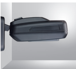
Locking Mount Bracket