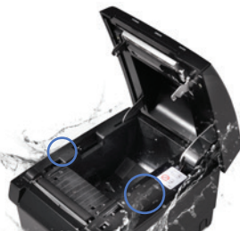
Dual layers for water protection