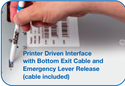
Printer Driven Interface with Bottom Exit Cable and Emergency Lever Release (cable included)