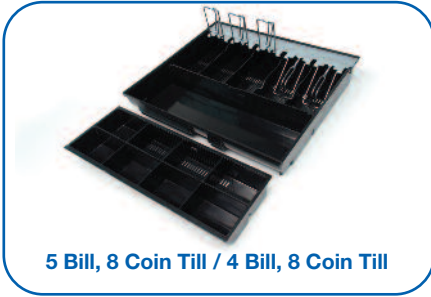
5 Bill, 8 Coin Till / 4 Bill, 8 Coin Till