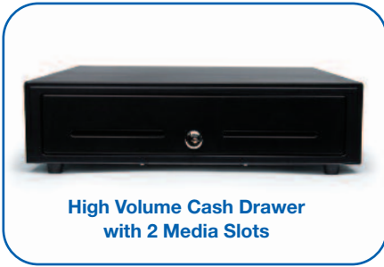
High Volume Cash Drawer with 2 Media Slots