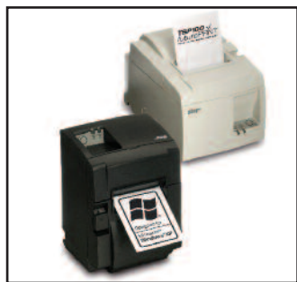
Gray & Putty