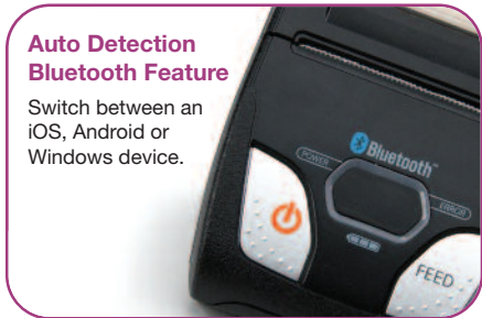
Auto Detection Bluetooth Feature

Switch between an iOS, Android or Windows device.