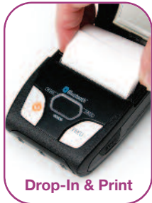
Drop-In & Print