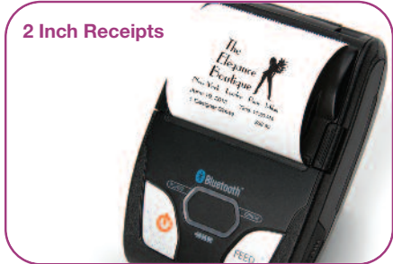
2 Inch Receipts