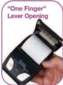
"One Finger" Lever Opening