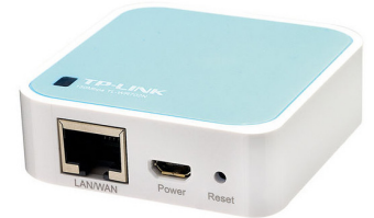
TP Link Wireless Router TL-WR702N