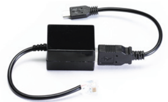
DK-USB Power Module

...connect with tablets, smart phones and other portable electronic wireless devices.